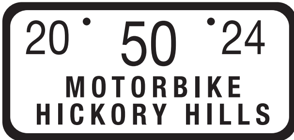
STYLE NO. JLC-1 2.25"x 4.25" with 1/8" HOLES

Made in style of auto license plates of enameled steel with embossed letters and figures. Background of any one standard color with face of letters, numbers and borders of any other contrasting color.