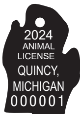
No. A-33 Michigan ONLY