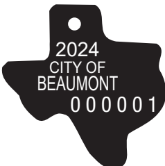
No. A-25 Texas ONLY