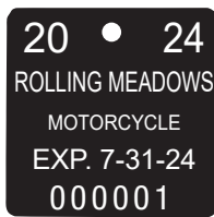
No. A-35 1/8" or 1/4" HOLE