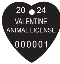
No. FEB 14