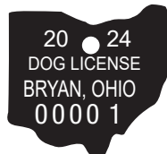
No. A-34 Ohio ONLY