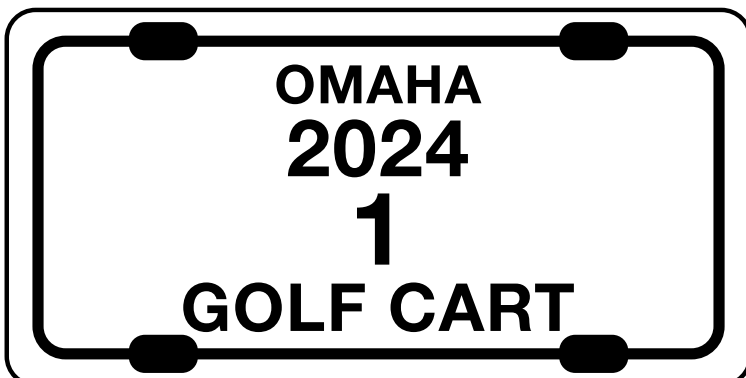
STYLE NO. JLC-2 3"x 6"

Aluminum plate with 4 holes furnished with white background and black numbering/lettering.